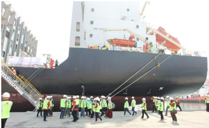
Photo 1. Participants during their visit to Samudera Indonesia Ship at the 6 th PPM RBCC

The final day will be running for one day only. The first day is the company visit and opening ceremony for the participants. All participants will be given a chance to meet the Directors / Senior Managers of the company that is written in the case. Participants would have time to explore more ideas about the company and to enrich their ideas to the presentation at the final day.