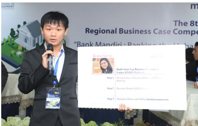
Photo 3. The Finalists were presenting their paper with other teams in front of juries and audience at the 8 th PPM RBCC