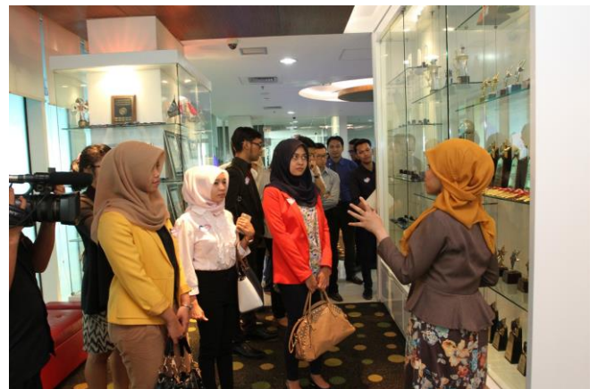
Photo 2. The Batavia Dancers performance in the welcoming ceremony of the 7 th PPM RBCC at PPM School of Management, Jakarta