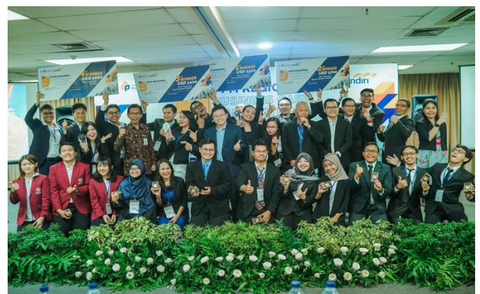
Photo 4. All Participants were taking photo together after the winner announcement at the 9 th PPM RBCC